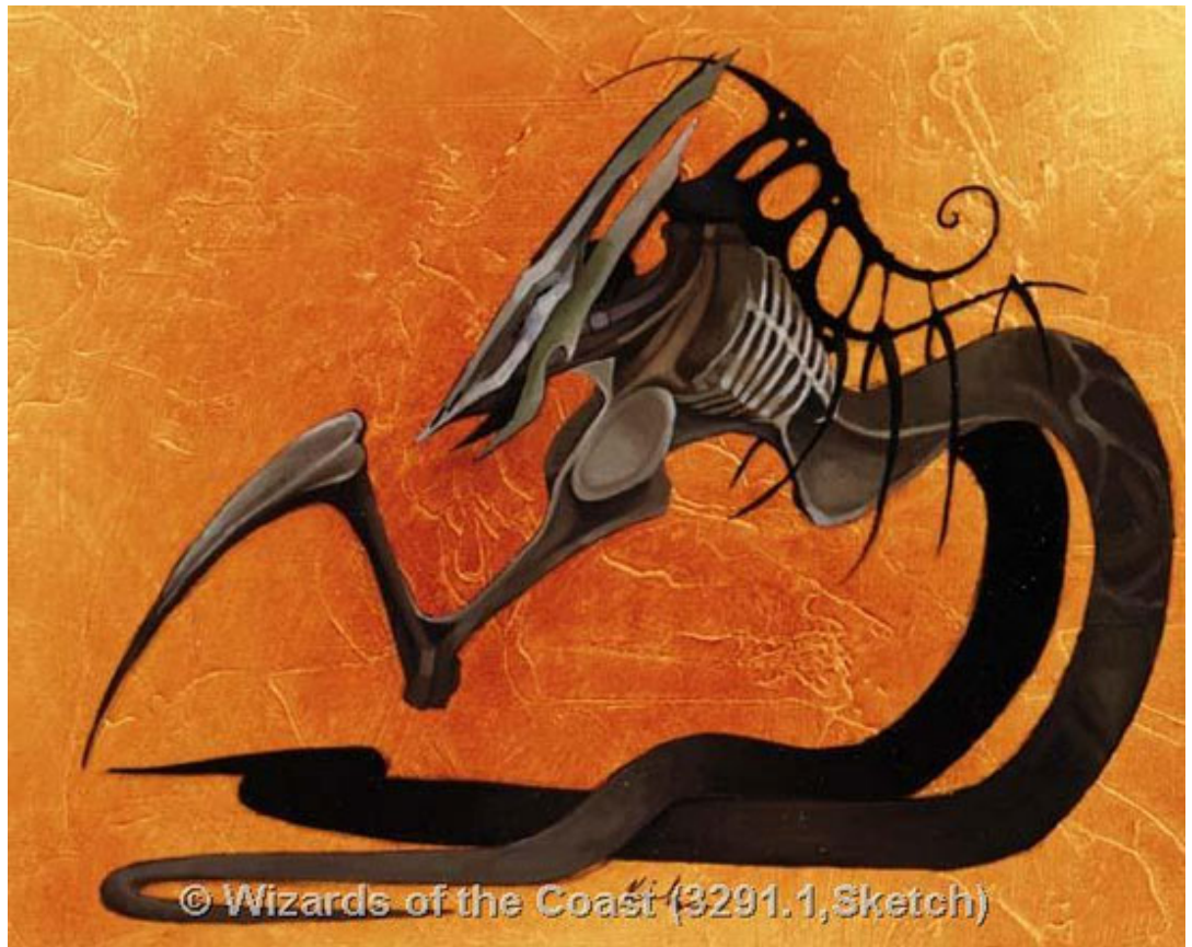
Armor Sliver by Scott Kirschner

Tempest has two cycles of Slivers: a common cycle of 1/1 Slivers for converted mana cost of 2 (plus Metallic Sliver for 1), and an uncommon cycle of 2/2 Slivers for 3. Today we present the art for the 2/2 uncommons. Enjoy.